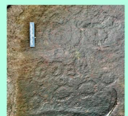
Gravures rupestres – environ 1800