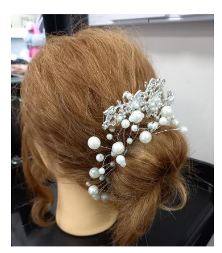
Bridal hair created by Lanie Price