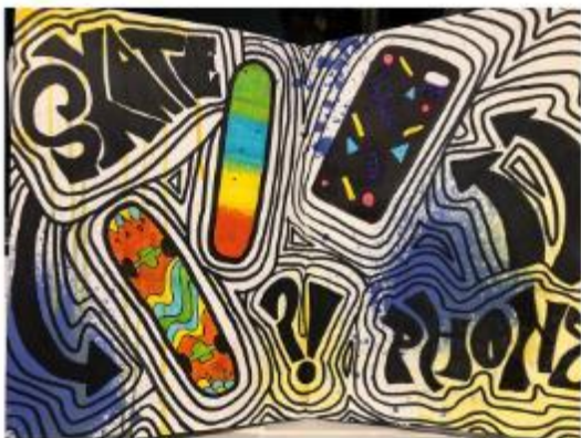
EXCELLENT DESIGN WORK BY SOPHIE HOLLAND Y8